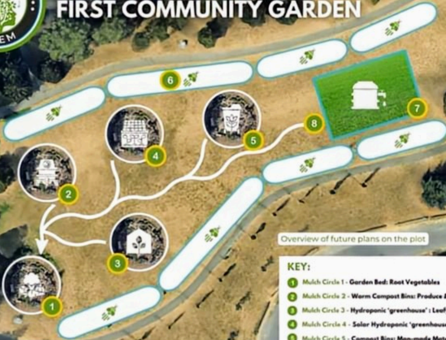
Overview of future plans on the plot